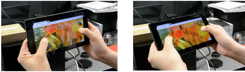
(a) Fruit Fly in the Initial Position (b) Fruit Fly after Moving the Tablet

The disadvantage is that the movement is sometimes very awkward because the range of working area is limited in the hexapod stage.