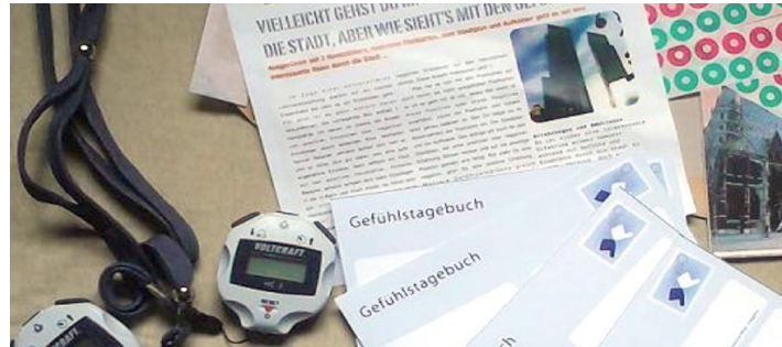
Figure 1. Cultural Probe (Counter, Emotion-Diary, etc.) [9]