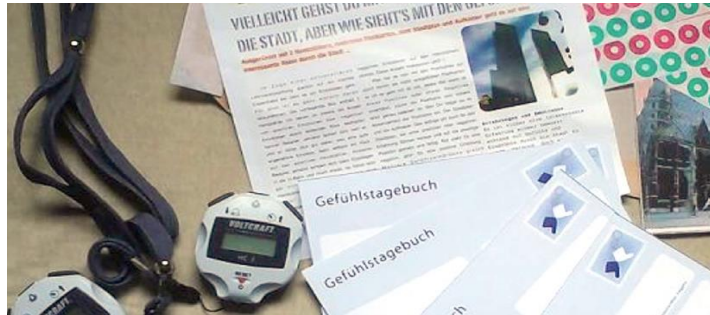
Figure 1. Cultural Probe (Counter, Emotion-Diary, etc.) [9]