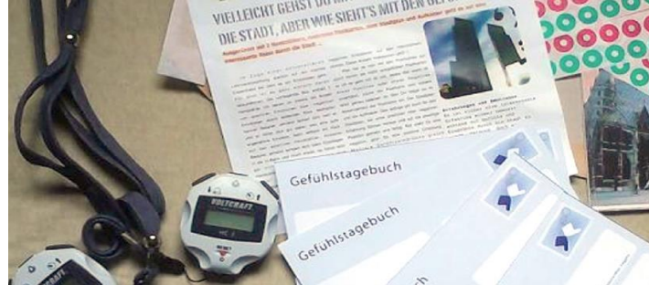
Figure 1. Cultural Probe (Counter, Emotion-Diary, etc.) [9]