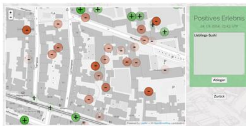
Figure 3. Representations of experiences (circles) fade out over time.

To fulfill these requirements the prototype consists of a wearable wristband, an Android smartphone application and a web backend. The wristband (Fig. 2) is made of comfortable fabric to ensure wearing comfort. All electronic parts are mounted in the wristband, however, the battery can be removed for charging. The wristband allows users to self-monitor their positive and negative experiences by pressing the corresponding button. Whenever a button is pressed the wristband sends a signal to the smartphone via Bluetooth. The smartphone application then acquires the current location, associates it with the experience and uploads the record to the web backend.