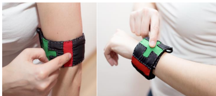
Figure 2. Using the ZENse wristband

In general, the prototype should help users by enabling them to monitor and visualize their daily emotional life. To keep the costs low only standardized hardware components and open web techniques are used. To gather viable data in a user-study the portable part of the prototype must work for a whole day without the need for re-charging. The visualization, used for self-reflection should be generated automatically.