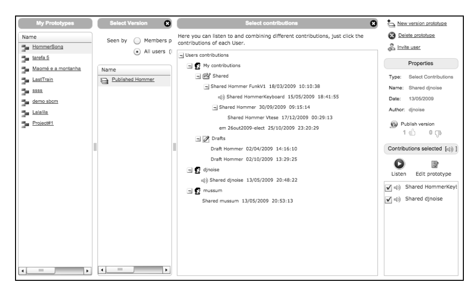
Fig. 1. Detail of the Prototypes, Versions and Contributions screen.

We believe that the newly proposed design criteria already potentially solve many of the problems observed in the previous version, since they are based on the experience of our team in the field of HCI, and also on modern best practices of Web application usability.