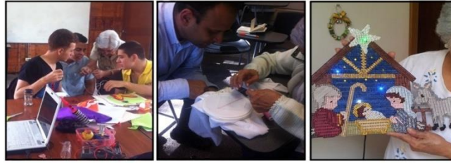
Fig. 2. E-embroidery workshop: using embroidery and electronic materials like conductive thread, we embroidered a crafted Christmas manger with illumination and interactivity.