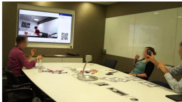
Fig. 2. Room set-up for the study

A session consisted of an introduction to the task and system, a 20 minute collaborative design session, followed by a 20 minute group interview. The task chosen for the design session was for participants to collaborate on a t-shirt design representing the company they work for. The task was chosen to encourage several participants to create, share and discuss both physical and digital artefacts. Participants were divided across 2 conference rooms with 3 collocated people in one room and a single person in the other. This configuration was chosen as we found the 2x2 configuration option to be limiting for exploring aspects of collocated interaction. As such we chose 3 people at one end to better represent these concerns in each session.