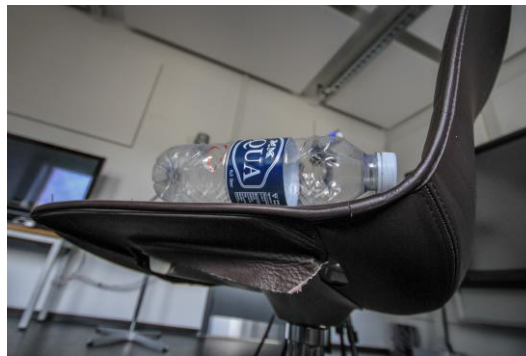
Fig. 3. Foreground: two physical artefacts from the workshop: a conference room chair with defective backrest (breakage behind the leather flap visible in the picture center), and a plastic bottle with a hole near the bottom (indicated by red marker outline on the bottle in the center-left). Background: the workshop lab.

Two usability consultants from industry, and a visual designer and a visual artist were recruited for a workshop. All were professionals making their primary income from their profession. Participants were remunerated by standard rates for consultancy work (the usability consultants), respectively by standard rates for expert participants (visual designer and artist). Participants were not informed about the purpose of, or tasks to be covered in, the workshop prior to its beginning, and were only informed about the purpose in the debriefing following the workshop. Scenarios were prepared for the workshop, consisting of a description and an associated physical artefact, software mockup or image of a physical artefact. The scenarios were divided into: (i) 8 goal-oriented scenarios, describing an artefact and what was broken about it, along with a particular goal to attempt to achieve, and (ii) 4 open scenarios, describing an artefact and encouraging users to both find out what was wrong with it, and what they