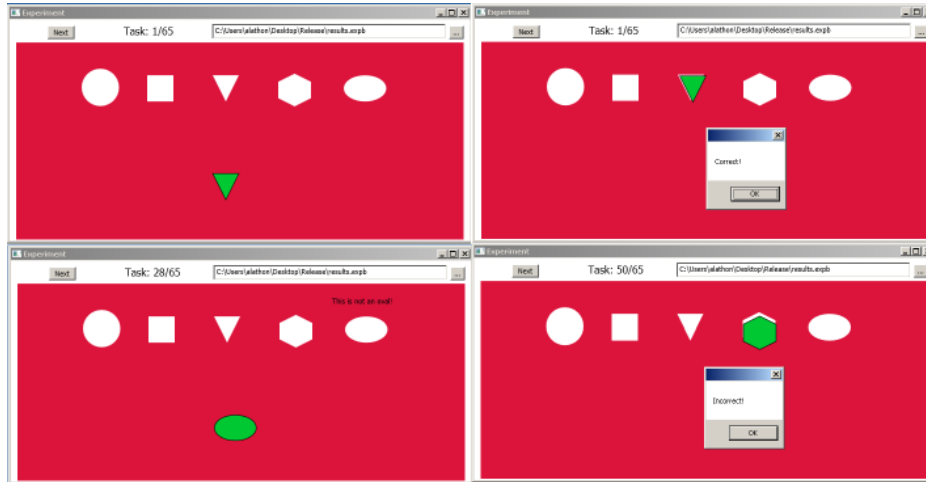
Fig. 4. The shape-sorter task. Top left: the green oval affords dragging to one of the white holes. Top right: feedback for correctly solving a task. Bottom left: Broken signifier: the green oval still affords dragging and dropping to the oval hole, but the text above the hole reads “this is not an oval”. Bottom right: Broken feedback: the hexagon is dropped correctly on top of the white hexagon, but the software responds with ‘Incorrect!’. The task has actually been completed correctly, so the software moves on to the next task (not depicted).