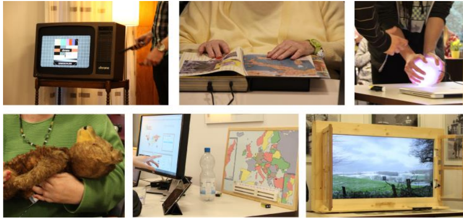
Fig. 2. Probes: Top row, left to right: Chrono TV with TV programs sorted by decade, Interactive Book with sound output based on opened page, Icho-Sphere reacting to user's touch. Bottom row, left to right: Music-Teddy playing songs from the 30s when lifted, Reminiscence Map with users' stories linked to time and place, Memory Window with scenes of familiar places.