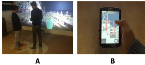
Fig. 4. Evaluation: (A) Test user interacting with the local participant during the evaluation session. (B) Handheld Client. User engaged in a sketch collaborative task.

We conducted a user evaluation to assess the interactions within the Eery Space, both with local and remote people. In our experiment, subjects were invited into the room with the main setup, while a remote user was in a room equipped with a lighter version with one Microsoft Kinect, one display showing the floor projection and a smartphone.