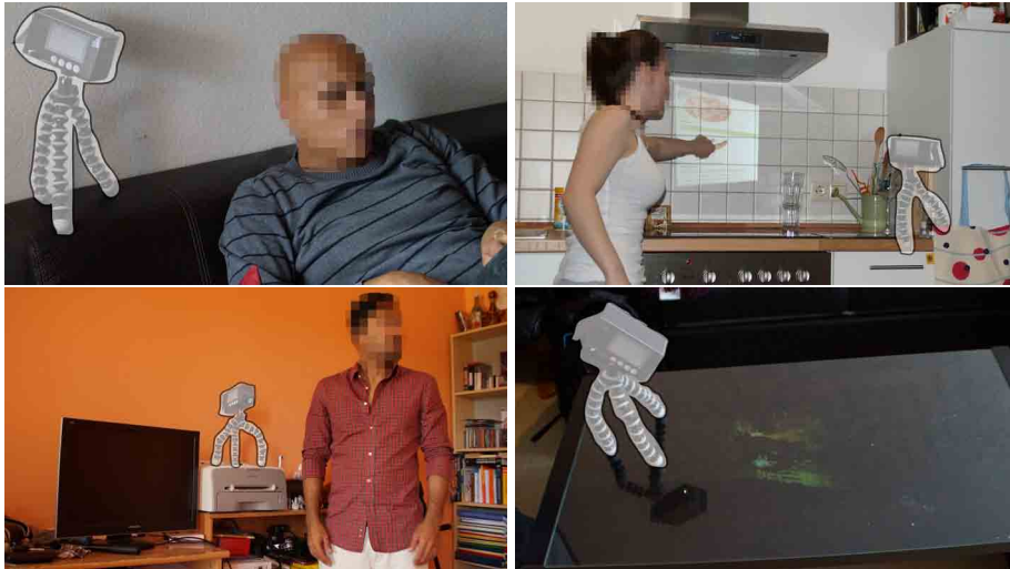
Fig. 3. Users building and explaining their setups (Mock-Up highlighted for better viewability).

vertical surfaces were used more often as a result of the lack of sufficient horizontal surfaces. The most used surface in the bathroom was the mirror (4). However, since the projection was not working on the mirror participants projected right next to it. In the corridor almost only vertical surfaces were created either onto the door (5) or the wall (2). As already mentioned in the section on use cases, the corridor was used to aid specific tasks that participants commonly undertake there. In this case the situation would be leaving the apartment , and when leaving the apartment, seeing the bus schedule and/or weather forecast on the door seemed natural to participants. P10 was the only participant who used the floor as a projection surface to create an interactive rug.