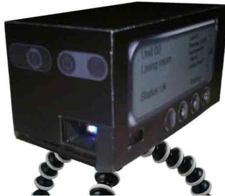
Fig. 2. Mock-up consisting of a projector inside a cardboard box mounted on a flexible camera stand

system would have limited the participants due to the technical implementation. For this reason we intentionally used a low fidelity mock-up.