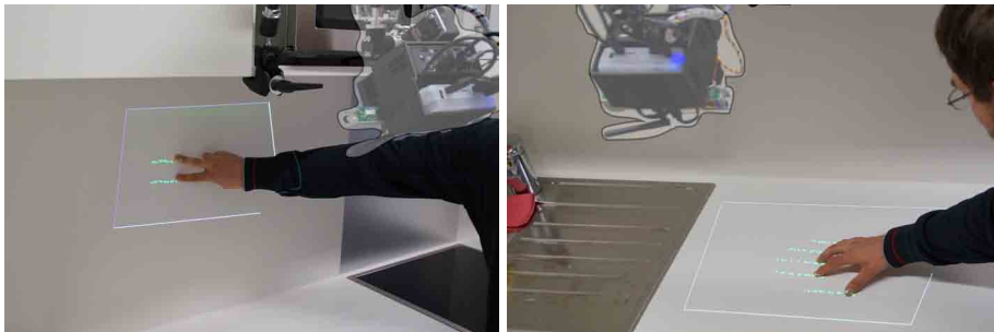
Fig. 5. Touch Interaction using the UbiBeam System (UbiBeam is highlighted for better viewability).

The final hardware construction measures 10.5 \text{ cm} \times 12.2 \text{ cm} \times 22.5 \text{ cm} including the pan-tilt unit and weighs 996 \text{ g} (Figure 1). To be able to easily mount the device to a variety of surfaces we adjusted it to a Manfrotto Magic Arm. The hardware components can be bought and assembled for less than 1000 USD.