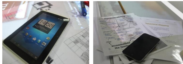
Fig. 2. Mobile devices in the artifact ecology

Initially, field notes were reviewed to create a preliminary system description guided by concrete principles provided by the DiCoT framework. The preliminary analysis indicated properties of the physical layout, main participants/tools and channels of communication and artifacts emerging as important. Second, we transcribed and reviewed the focus group data, classifying them in three major thematic units according to the DiCoT models - physical layout, information flow and artifacts as in Table 1.