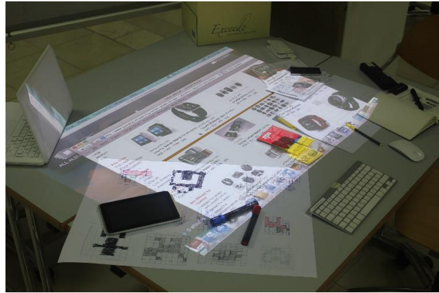
Fig. 1. Downward pointing projection

During the three month duration of the study, we observed and kept field notes of weekly sessions regarding group's procedures and the role of technology in their practices. We also collected self-reported data through conducting a focus group with each group at the completion of the course. The focus groups aimed to collect information about students' learning experiences within the artifact ecology, cognitive aspects of their actions and the affordances of the technologies provided. As a triangulation data source, we video-recorded all the collaborative sessions.