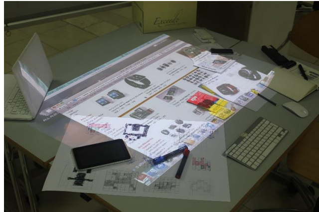
Fig. 1. Downward pointing projection

During the three month duration of the study, we observed and kept field notes of weekly sessions regarding group's procedures and the role of technology in their practices. We also collected self-reported data through conducting a focus group with each group at the completion of the course. The focus groups aimed to collect information about students' learning experiences within the artifact ecology, cognitive aspects of their actions and the affordances of the technologies provided. As a triangulation data source, we video-recorded all the collaborative sessions.