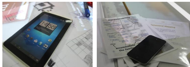
Fig. 2. Mobile devices in the artifact ecology

Initially, field notes were reviewed to create a preliminary system description guided by concrete principles provided by the DiCoT framework. The preliminary analysis indicated properties of the physical layout, main participants/tools and channels of communication and artifacts emerging as important. Second, we transcribed and reviewed the focus group data, classifying them in three major thematic units according to the DiCoT models - physical layout, information flow and artifacts as in Table 1.