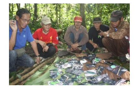
Fig. 4. Elders grouping Oroo' sign cards

We were shown only three signs that are placed on the ground next to 'Batang