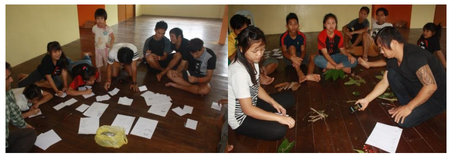
Fig. 6 a & b Left: SMS composing, Right: Oroo' sign creation

in writing sms, reading others, laughing out loud and replying promptly (Fig. 6a). Within less than 15 minutes 89 sms texts were created, with one third in Malay and the rest in English. A first grouping of identical or similar sms texts showed the highest occurrences of the following messages: "What are you doing?" (7), meeting up (7), "what do you mean? (4), where about question (4). Considering the large number of sms texts created the group agreed on 13 sms texts to create Oroo' signs for during the workshop (see an excerpt in table 1).