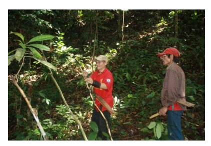
Fig. 1. Elders creating Oroo' messages

recorded the process of making the signs and taken photos of each one. We have documented the name and description of each sign and combinations thereof. At each visit an elder constructed Oroo' signs and messages as they came to his mind in the real environment. The authenticity was verified by a second accompanying elder. Considering the density of the jungle, the clarity and details of the signs and messages are at times blurred on the digital photos, as other twigs, branches and leaves are all around. Thus, a local artists group was engaged to draw each Oroo' sign. The drawings helped to understand the detailed complexities of the Oroo' signs (Fig. 2, 3). The drawings are used alongside the photographs for further discussions, documentations and categorizations. All the drawings, photos and descriptions were reconfirmed by the community elders in community meetings.