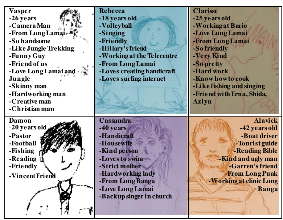
Fig. 5. Personas created by the Youth

as leading to better design decisions and defining the product's feature"[23]. Mostly personas are created by the designers as an amalgamation of collected data about users thereby creating a typical user. We have adapted the method to participatory design principles, where the user participants, the Long Lamai youth, generated their own personas. The group of youth was split in a group of girls and a group of boys each creating a male and a female youth persona. Then as a full group they jointly described an older male and female persona. Thus a total of 6 personas were generated (Fig. 5). The primary aim of the personas was for the youth to sufficiently identify with the one or the other persona for the next phase of the workshop and to be able to compose sms texts freely without them being attributed to any participant.