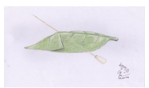
Fig. 2. Drawn Oroo' sign for "hunted wild boar"

Sign Combinations. In the absence of a documented grammar we have recently engaged in a systematic exercise to explicate the tacit rules of combining the signs forming a valid message, as well as categorizing the signs. While at this point our analysis is still incomplete, we have uncovered a number of subtle variations and meanings in the message composition. Firstly the 'Batang Oroo' (or 'message stick') which shows the direction where the sign maker (writer) is going and also has different positions where signs can be attached and thereby combined to a full message (see Fig. 3).