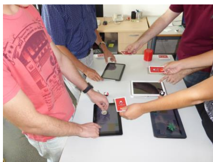
Fig. 1. Hypothetical collaborative scenario with ADI using fiducial markers

Our end future goal is to design MDE collaborative environments around a table like the one shown in Fig. 1, where users bring their own devices and where they may use cards or tangible elements with attached fiducial markers to share objects (e.g., documents, game elements) or trigger reactive behaviors in a target surface on the table. The built-in camera in each device is used for the marker detection; therefore no additional hardware infrastructure is required. In this kind of setting, several interactive surfaces can be placed on a table at different distances, rotations, etc. Thus, the entry point at which users approach each surface can dramatically change, and so can the conditions surrounding the interaction itself. As such, before designing any complex ADI for these settings, the fundamental issue that must be addressed is the acquisition of the marker [13] (i.e., the initial step at which the fiducial marker is placed in the camera's field of view for it to be detected), and evaluating how usable this is under different conditions. The main aim of this paper then is to present an ADI technique that uses fiducial markers and to obtain the ground knowledge that will enable us to design a table-based MDE that uses it effectively. Specifically, we evaluate the usability of the acquisition phase of the proposed ADI through an in-lab study, focusing on the ergonomic conditions that are perceived as facilitators of this interaction.