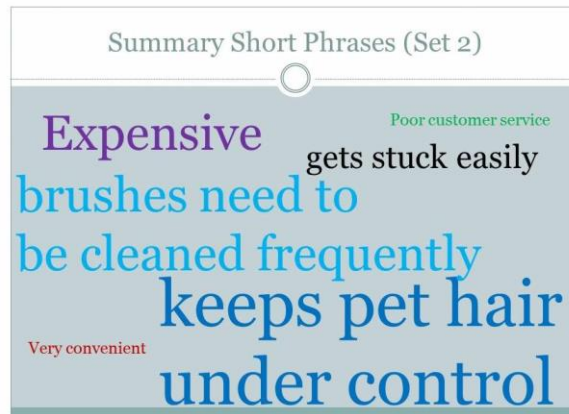
Fig. 1. Tag clouds