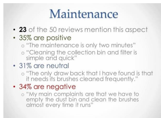
Fig. 2. Aspect Oriented Sentiments

Aspect oriented sentiment summarization is an active area of research in text mining [11, 13, 14, 19, 23]. In this approach, some important aspects or topics (also known as features) of opinions are extracted from an opinion collection. Sentiment orientation of the text snippets containing the aspects are then estimated and summary statistics reported. A typical summarization for one aspect might look like this: for a collection of reviews on Kindle Fire, "screen" is identified as an aspect, and 100 text snippets in the collection are found to be about this aspect, 60 of them have positive sentiment, 30 of them are negative, and the rest are neutral. Representative text snippets for each sentiment orientation may also be provided. See Figure 2.