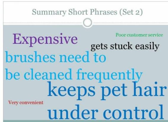
Fig. 1. Tag clouds