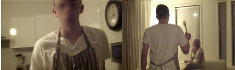
Son: [looks at the eco-feedback, turns to mother] You were using the heat lamp!

The two teenage boys from Family 9 made a short film for their Steven Spielberg Challenge. This film parodied the human power relations of saving energy in the home and the lead-user of the eco-feedback getting a little too obsessed with his “Spherey”- a nickname for the Ecosphere eco-feedback system. This involved one son dressed up in an apron and spectacles, menacing his co-inhabitants with a spatula.