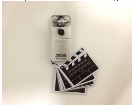
Figure 1: The deployed video camera

The SAVI methodology was trialled with 12 families living in suburban South East Queensland in Australia. These 12 families had all received an eco-feedback system called ‘Ecosphere’ within the previous six months. The majority of the 12 families were married or de facto and all but three had children living at home. Nine self-authored videos were created in total; two families said they had been too busy and one did not feel comfortable recording themselves. Video cameras (Figure 1) were deployed in the homes for a period of 1-2 weeks before being picked up.