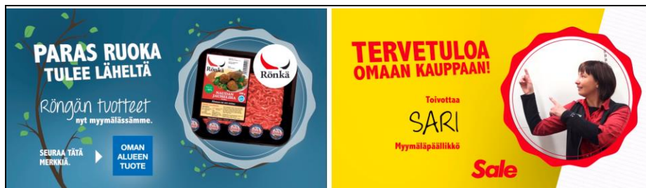
Fig. 2a&b. Examples of display content. In Fig. 2a the template is Background animation: the branches and leaves grow in the background. The content theme is 2) Local food. The text says ‘Best food is local – Rönkä’s products now in our store – Follow this sign > Local product’. In Fig. 2b the template is Fact animation: the text “Tervetuloa omaan kauppaan!”(i.e. Welcome to your own store!) appears when the store manager turns and points to her upper right. She also briefly looks further down at her name “Sari”. The content theme is 3) Familiarity with the store manager. The text says ‘Welcome to your own store! – Wishes Sari, the store manager’.

All digital displays utilized in the pilot were located indoors. In the grocery stores the displays were typically located quite close to a cash desk. In the supermarket they were located along the corridors. The displays were located quite high with the exception of one small display that was located on a lower level nearby a cash desk that was used only during the peak hours. All displays had rather large screens (about 50 inches), excluding the small display mentioned above.