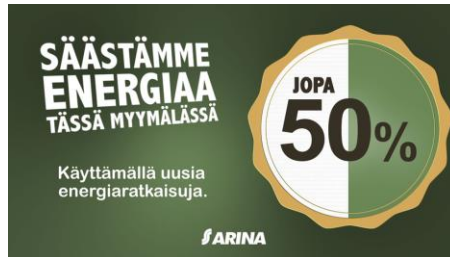
Fig. 1. An example of display content. The template is Still picture: nothing is animated. The content theme is 1) Energy savings. The text says: ‘We are saving energy in this store - up to 50% - using new energy solutions’.