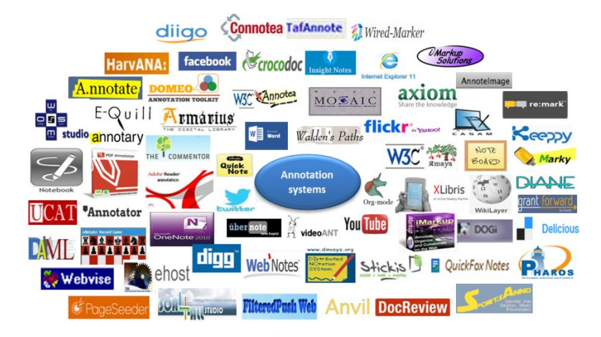
Fig. 1. Several annotation systems are developed in different contexts.

Annotation systems have been developed since the 90<sup>th</sup> to transpose on electronic document the secular practice of annotation. Then, these systems have gradually taken advantage of processing capabilities and communication of modern computers to enrich the practice of electronic annotation [20]. An annotation system or still called annotation tool or "annoteur", is a system allowing users to annotate various types of electronic resources with different kind of annotations [29]. Many researchers have been interested in the creation of annotation tools to facilitate the annotation practice of the annotator in digital environment. We can find numerous commercial software and research prototypes created to annotate electronic resources (see Figure 1).