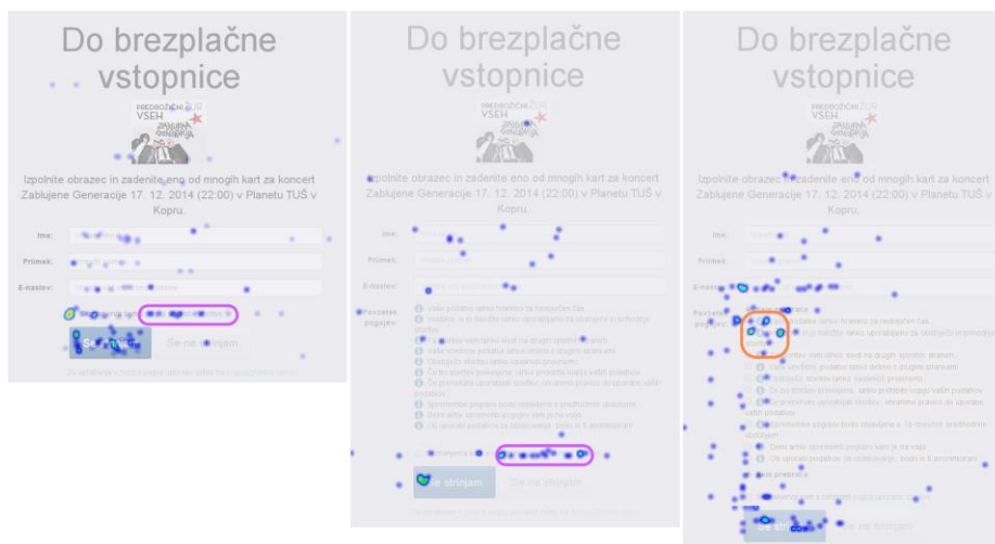
Fig. 3. Interaction with the forms. The number of clicks in each particular spot is visualised on a blue-green-yellow scale from low (blue) to high (yellow) number of clicks

The interaction with the forms can be seen on Figure 3 . Clicks are shown on a blue-green-yellow scale from low (blue) to high (yellow) number of clicks. On F1 and F2 visitors often clicked on the link (bordered purple) above the “I Dis/Agree” buttons that showed the ToS below the form. Interestingly, on F2 visitors rarely clicked on information links by each ToS key point. By clicking on these information icons before each key point the related ToS section was revealed. However, the F3 shows the opposite. Visitors were forced to interact with ToS key points and often clicked on the information icons by the checkboxes to reveal the related ToS section. This is particularly visible by the top key points (bordered orange), while the frequency of clicks