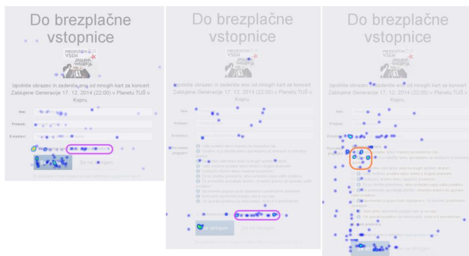
Fig. 3. Interaction with the forms. The number of clicks in each particular spot is visualised on a blue-green-yellow scale from low (blue) to high (yellow) number of clicks

The interaction with the forms can be seen on Figure 3 . Clicks are shown on a blue-green-yellow scale from low (blue) to high (yellow) number of clicks. On F1 and F2 visitors often clicked on the link (bordered purple) above the “I Dis/Agree” buttons that showed the ToS below the form. Interestingly, on F2 visitors rarely clicked on information links by each ToS key point. By clicking on these information icons before each key point the related ToS section was revealed. However, the F3 shows the opposite. Visitors were forced to interact with ToS key points and often clicked on the information icons by the checkboxes to reveal the related ToS section. This is particularly visible by the top key points (bordered orange), while the frequency of clicks