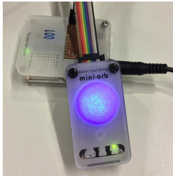
Fig. 1. MiniOrb sensor platform (background) and ambient interaction device (foreground)

The MiniOrb device is an ambient and tangible interaction device that records user's office comfort preference values, displays both sensor reading from the user's local sensor platform, as well as average comfort preferences across all users (see Fig. 1 , foreground). The device consists of three small LED's that indicate different states, a piezo speaker, a button and a scroll-wheel potentiometer for user input, as well as a dome-shaped "orb", a 3D-printed plastic light diffuser which contains a bright RGB-LED and a laser-etched/cut cover.