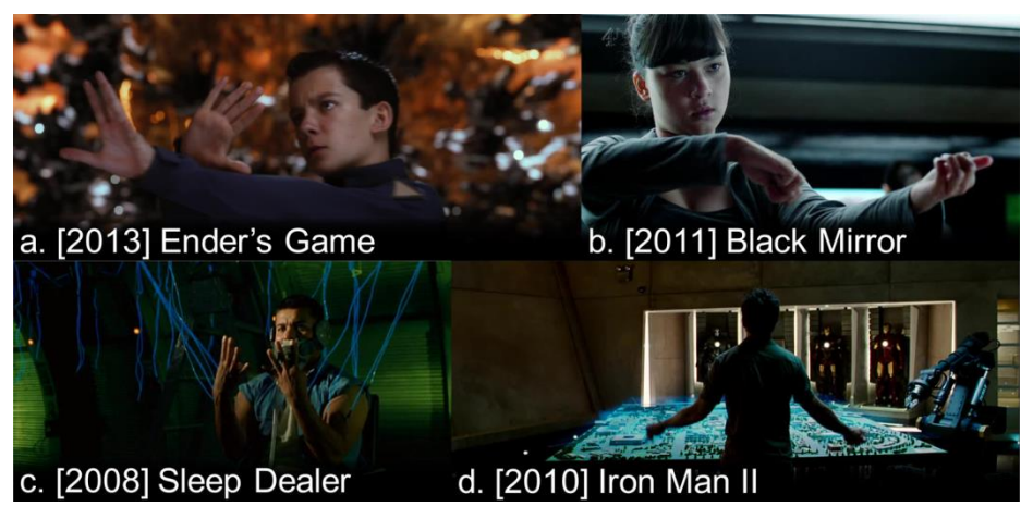
Fig. 2. Examples of movies that compose the used dataset in this study

for similar video analysis of different data; the application is based on a Google Spreadsheet content being adaptable to any type of categories as long as there is a video for each row entry. Secondly, video snippets containing hand and arm interactions were collected and categorized along 215 scene parts from 24 different titles. Figure 2 shows some of the scenes in which the users interact with the systems using gestures. In Ender's Game (Fig. 2a) and Sleep Dealer (Fig. 2c) the protagonists use their hands to remotely control a spaceship and an aircraft, respectively. The woman from Black Mirror (Fig. 2b) is playing a virtual violin, while Tony Stark from Iron Man (Fig. 2d) controls a hologram that represents the city and then he can zoom in and out any place of interest, or delete things from the model with just a flick. At last, in order to support additional analysis, all the scene parts were categorized according to some established criteria as for example the application domain, if there was an identified interaction pattern in the scene or which was the used input device.