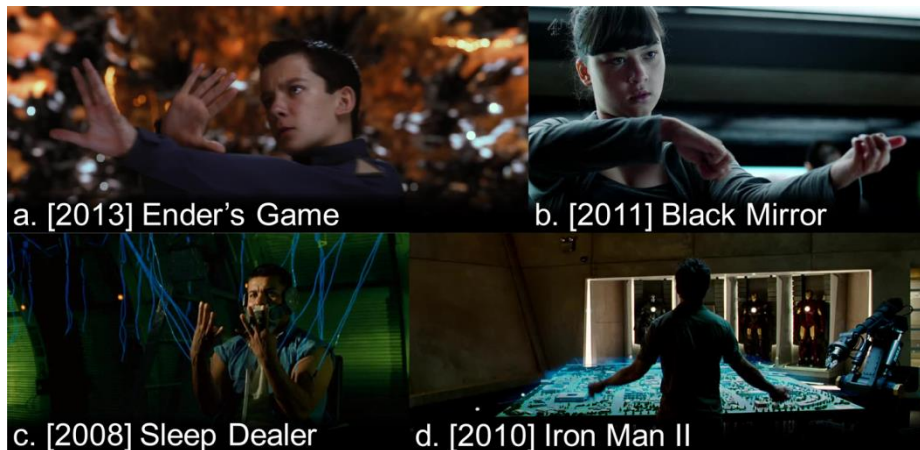
Fig. 2. Examples of movies that compose the used dataset in this study

for similar video analysis of different data; the application is based on a Google Spreadsheet content being adaptable to any type of categories as long as there is a video for each row entry. Secondly, video snippets containing hand and arm interactions were collected and categorized along 215 scene parts from 24 different titles. Figure 2 shows some of the scenes in which the users interact with the systems using gestures. In Ender's Game (Fig. 2a) and Sleep Dealer (Fig. 2c) the protagonists use their hands to remotely control a spaceship and an aircraft, respectively. The woman from Black Mirror (Fig. 2b) is playing a virtual violin, while Tony Stark from Iron Man (Fig. 2d) controls a hologram that represents the city and then he can zoom in and out any place of interest, or delete things from the model with just a flick. At last, in order to support additional analysis, all the scene parts were categorized according to some established criteria as for example the application domain, if there was an identified interaction pattern in the scene or which was the used input device.