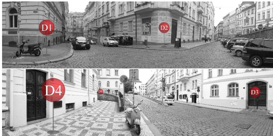
Fig. 1. Panorama from the beginning of the route containing decision points D1 and D2 (top), and from the end of the route containing decision points D3, D4, and D5 (bottom).

Description of the route. For our experiment, we selected a city center outdoor environment. Environments for this type of experiment are usually real environments [26, 4] rather than artificial (lab) environments, though exceptions are possible [28]. The location of the route was in a quiet area in the city center of Prague, Czech Republic (see Fig. 1, 2). It was 256 m in total length (from S via D1-D5 to B11) and navigation via phone took place on the 105 m long final part of this route (from D1 to B11). In the initial part (from S to D1) of the route the traveler walked alone. This was done to allow the traveler to get oriented and to get familiar with the surrounding environment of D1. Along the route there were 5 decision points (D1-D5) to which the navigator tries to navigate the traveler , number of surface changes (SFx), acoustic landmarks (Ax), vertical traffic signs and columns (Cx), and doors (Bx) (see Fig. 2).