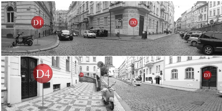
Fig. 1. Panorama from the beginning of the route containing decision points D1 and D2 (top), and from the end of the route containing decision points D3, D4, and D5 (bottom).

Description of the route. For our experiment, we selected a city center outdoor environment. Environments for this type of experiment are usually real environments [26, 4] rather than artificial (lab) environments, though exceptions are possible [28]. The location of the route was in a quiet area in the city center of Prague, Czech Republic (see Fig. 1, 2). It was 256 m in total length (from S via D1-D5 to B11) and navigation via phone took place on the 105 m long final part of this route (from D1 to B11). In the initial part (from S to D1) of the route the traveler walked alone. This was done to allow the traveler to get oriented and to get familiar with the surrounding environment of D1. Along the route there were 5 decision points (D1-D5) to which the navigator tries to navigate the traveler , number of surface changes (SFx), acoustic landmarks (Ax), vertical traffic signs and columns (Cx), and doors (Bx) (see Fig. 2).