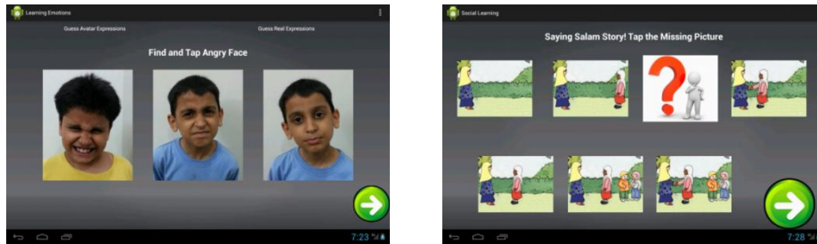
Fig. 1. Learning Emotions and Expressions (left) and Social Learning (right)

Keeping in mind the cultural context, actual facial expressions of Pakistani children and elders were used in these games. In case of emotion finder, we used culture-specific backgrounds. The goal was to improve children’s non-verbal communication skills and help them in improving their understanding of basic and complex emotions and expressions.