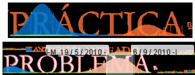
Fig. 1. On up,the representation of a single tag on Temporal tagcloud, on down, “view of tag problema”.

The main goal of the visualization is to provide a compact representation of the forums' interaction on VLE overall use, and its evolution over the time. Usually, a tagcloud presents a certain number of most often used tags in a defined area of the user interface. A tag's popularity is expressed by its font size (relative to the other tags). Next to their visualization function, tagclouds are also navigation interfaces as the tags are usually hyperlinks leading to a collection of items they are associated with. Furthermore, several layout variations emerged on the basic design principles of tag clouds. Also the representativeness evolution of each tag over the time is one of the goals of the representation. Fig. 1 up provides an overview of a tag with its three main components: the bar-graph, wave-graph representation and the tag. The bar-graph and wave-graph representation curves, shown in the Fig. 1, shows the significance of document content, represented by a word, over time. The size of the words font represents the meaningful of the word on forum activity of the VLE.