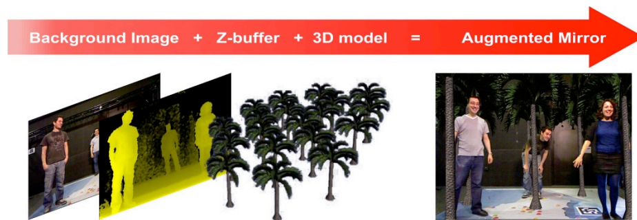
Fig. 2. Augmented reality scene composition using depth information.

information, performing a correct occlusion between real (visitors and exhibition room) and virtual (3D models, maps, etc.) worlds. This process can be observed in Figure 2.