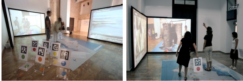
Fig. 3. 7 Pointers and exhibition set (left); visitors using the system (right).

points of the exhibition. Furthermore, the interface based on selection pointers and hot points located on the map was used by the visitors naturally.