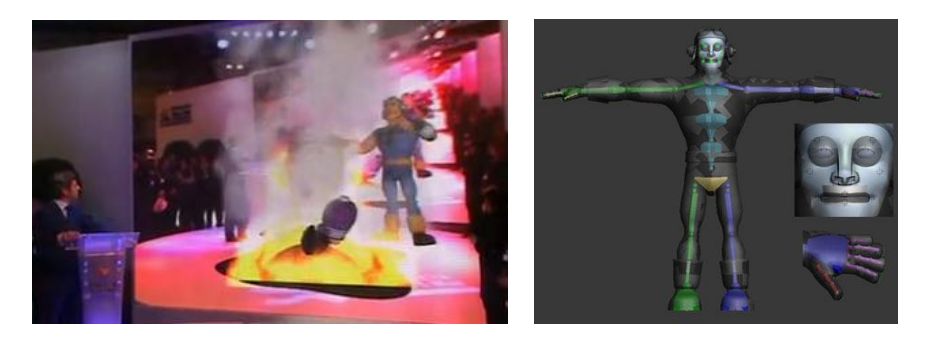
Fig. 3. Augmented mirror (left); avatar skeleton (right).

experience. A Kinect camera is used to capture the real image of the audience which is used in both scenarios. In the control scenario the real actor can see the audience to interact with them, while this image is merged with the avatar and the virtual elements to generate the augmented mirror image. The occlusion handling is implemented on a GPU shader, which takes the real image and the depth information captured by Kinect, mixing it with the virtual scene. The implementation of the augmented visualization is based on OpenSceneGraph, Cal3D and our own developed libraries. The avatar skeleton (see Figure 3), has been designed to perform all the gestures and facial expressions desired.