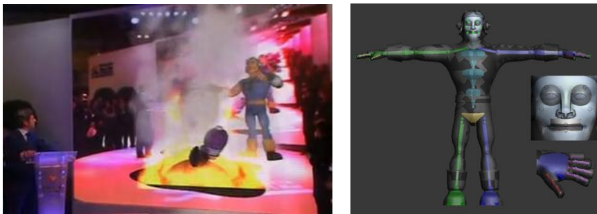
Fig. 3. Augmented mirror (left); avatar skeleton (right).

experience. A Kinect camera is used to capture the real image of the audience which is used in both scenarios. In the control scenario the real actor can see the audience to interact with them, while this image is merged with the avatar and the virtual elements to generate the augmented mirror image. The occlusion handling is implemented on a GPU shader, which takes the real image and the depth information captured by Kinect, mixing it with the virtual scene. The implementation of the augmented visualization is based on OpenSceneGraph, Cal3D and our own developed libraries. The avatar skeleton (see Figure 3), has been designed to perform all the gestures and facial expressions desired.