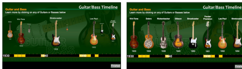
Figure 1. Homepage with 3D carousel vs. without 3D carousel

We conducted a 4 (Click only, Click + Slider, Click + Slider + Drag, Click + Slider + Drag + Mouseover) × 2 (presence or absence of 3D carousel) between-subjects fully-crossed factorial experiment. Participants recruited from undergraduate classes ( N = 143 ; 93 females) were randomly assigned to one of the eight conditions. Eight prototype websites were especially constructed for this experiment based on an online exhibition entitled “Guitar/Bass Timeline” [5]. Except for the number of interaction techniques employed, all eight versions of the prototype website shared the same content and page layout. We embedded the manipulation of 3D carousel in the homepage (Figure 1). Whenever participants clicked on a guitar in the homepage, the site played a brief audio-clip of a classic riff produced by that particular guitar/bass.