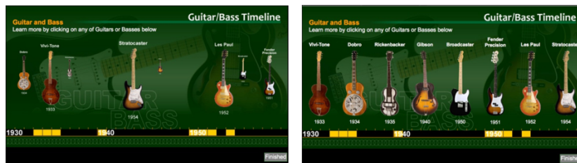
Figure 1. Homepage with 3D carousel vs. without 3D carousel

We conducted a 4 (Click only, Click + Slider, Click + Slider + Drag, Click + Slider + Drag + Mouseover) × 2 (presence or absence of 3D carousel) between-subjects fully-crossed factorial experiment. Participants recruited from undergraduate classes ( N = 143 ; 93 females) were randomly assigned to one of the eight conditions. Eight prototype websites were especially constructed for this experiment based on an online exhibition entitled “Guitar/Bass Timeline” [5]. Except for the number of interaction techniques employed, all eight versions of the prototype website shared the same content and page layout. We embedded the manipulation of 3D carousel in the homepage (Figure 1). Whenever participants clicked on a guitar in the homepage, the site played a brief audio-clip of a classic riff produced by that particular guitar/bass.