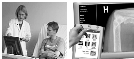
Figure 2: Using handheld devices together with bedside mounted patient terminals

The video recordings from the evaluations were analyzed using methods from video-based studies of human interaction with technology [13], while the interview data was analyzed qualitatively using methods influenced by grounded theory.