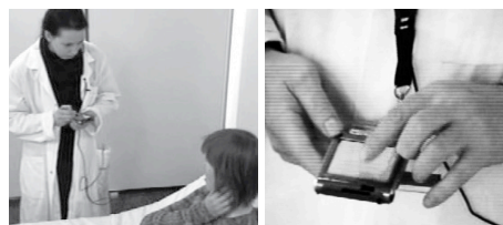
Figure 3: Comparing interaction techniques for handheld medication system