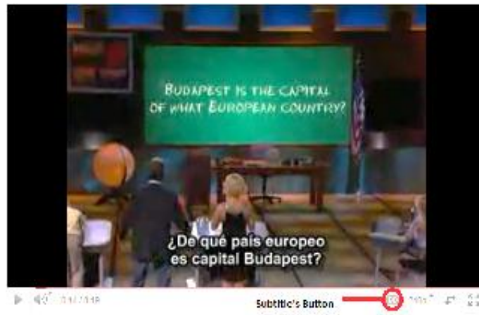
Figure 2 YouTube's screenshot that shows CC button.