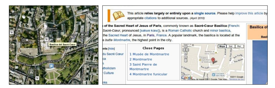
Fig. 1. Inter-application CSN between Google Maps and Wikipedia

Figure 1 shows an example of concern-sensitive navigation across two applications: Google Maps (as the source of navigation) and Wikipedia (as the target). The left-side of Figure 1 displays Wikipedia links in the map of Paris; once selected, these links trigger the exhibition at the right-side of Figure 1 the corresponding map and a set of links to those Wikipedia articles in the surroundings of the current one.