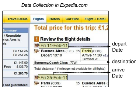
Fig 3.a. Information extraction from expedia.com

The scenario presented in this section aims at fulfilling users' needs described at section 1. While booking flights to Paris, the user collects data (cf. Figure 3.a) which will help him in the next steps to find a hotel. Relevant information is labelled by the user as departDate , arriveDate and destination . Figure 3.b shows how the form field destination is filled in with the information previously collected. This scenario is executed once the user reaches the page booking.com (either by following a link or entering a new URL). Notice that the scenario can be instantiated because the information needed is available into de Pocket . So far, automatic form filling can only be done for a particular Web application (in our case for booking.com ) but this feature can be extended using tools like Carbon [1]. This use of concern-sensitive information improves the user experience by allowing him to “transport” critical data among Web applications and use these data to adapt them.