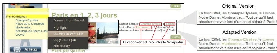
Fig 4. Text plain converted into link to add personal navigation.

Figure 4 exemplifies the use of the augmeter WikiLinkConversion . In this scenario, we assume the user has previously visited the web site Wikipedia.com and selected his PointOfInterest . Then the user opens the web site Parisinfo.com . It is worthy noting that the Pocket features all information previously collected at the web site Wikipedia.com . Now, the user right clicks over PointOfInterest , a contextual menu offer the option “Convert to Wiki Link” that, once selected by the user, will run the augmeter WikiLingConversion , thus creating new links on the current page of the web site ParisInfo.com allowing the navigation to the web site Wikipedia.com to the corresponding page associate to the information PointOfInterest . The augmeter Highlight works in a similar way but it changes the colour of the text instead of created links. Due to space reasons, the augmeter Highlight is not illustrated here.