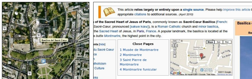
Fig. 1. Inter-application CSN between Google Maps and Wikipedia

Figure 1 shows an example of concern-sensitive navigation across two applications: Google Maps (as the source of navigation) and Wikipedia (as the target). The left-side of Figure 1 displays Wikipedia links in the map of Paris; once selected, these links trigger the exhibition at the right-side of Figure 1 the corresponding map and a set of links to those Wikipedia articles in the surroundings of the current one.