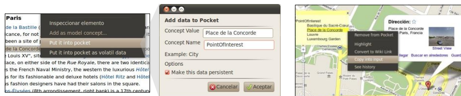
Fig 2.a. Information collection from Wikipedia using a DataCollector .

Two types of DataCollectors have been implemented: Untyped Pocket which implements a copy & paste behaviour for simple text (e.g. “Paris”); and Typed Pocket which allows users to label data (e.g. “Paris” is “City”). In both cases, selected information is placed into a temporary memory called Pocket . Data collection is supported via the contextual menu options “ put it into pocket ” (i.e. Typed Pocket ) and “ put it into volatile pocket ” (i.e. Untyped Pocket ). Figure 2.a illustrates the collection of a piece of information (i.e. Place de la Concorde ) using the option “ put it into pocket ” which has been labelled “ PointOfInterest ”. Collected information become available into the Pocket as shown by Figure 2.b (yellow box at the upper-left side).