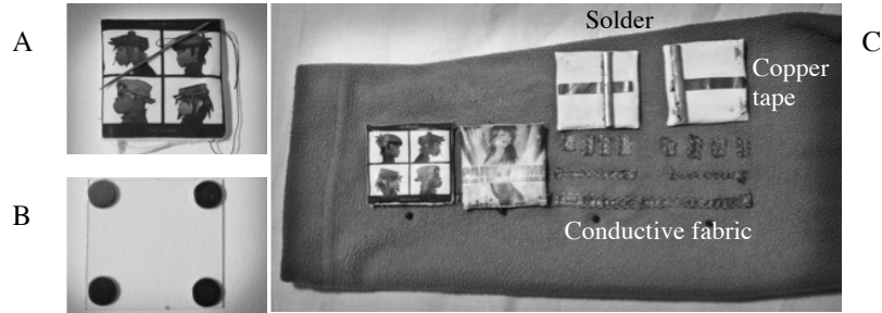
Fig. 2. Patch sensor A) front of final tag B) inner structure of tag showing rare-earth magnets at each corner C) jacket sleeve with conductive fabric; two tags are attached and two tags show circuitry on the back of the tags.

physical texture felt when adjusting the moveable element and its persistent, visually observable position. The physical state of the device mirrors the state of the sensed digital data. They can also both be integrated into the functional fastenings of an item of clothing to measure aspects of the garment state – for instance whether or not a jacket or pocket is open or closed. Alternatively, they can be sewn into a non-functional zone to serve as a control device capable of manipulating a variable such as the volume in wearable media player (continuous input with the zipper) or the ring tone profile selected on a mobile phone (discrete input with the cord and bead). We believe these devices provide general-purpose functionality for wearable applications.