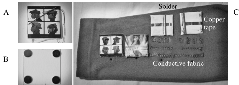
Fig. 2. Patch sensor A) front of final tag B) inner structure of tag showing rare-earth magnets at each corner C) jacket sleeve with conductive fabric; two tags are attached and two tags show circuitry on the back of the tags.

physical texture felt when adjusting the moveable element and its persistent, visually observable position. The physical state of the device mirrors the state of the sensed digital data. They can also both be integrated into the functional fastenings of an item of clothing to measure aspects of the garment state – for instance whether or not a jacket or pocket is open or closed. Alternatively, they can be sewn into a non-functional zone to serve as a control device capable of manipulating a variable such as the volume in wearable media player (continuous input with the zipper) or the ring tone profile selected on a mobile phone (discrete input with the cord and bead). We believe these devices provide general-purpose functionality for wearable applications.