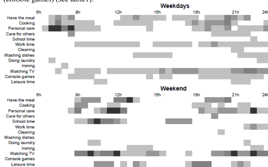
Fig. 2. Distribution of family activities over time during weekdays and weekends.

constantly switches on the TV whenever he walks around the house, even if he's not there watching, in the kitchen, in the bedroom, in the living room..." (family 7, Mother, ref3). The powermeter gave family members the ability to support their arguments with data, as in one case where children complained about the fathers' use of his personal computer in response to his criticism on their use of console games. In other cases, family members used energy cues to infer behavior, such as when parents observed that their children spent too much time with console games, or the presence of the maid: "on Mondays the maid comes and vacuums, cleans, irons as we checked in the computer [powermeter] that day is an energy peak for us" (family 28, Father, ref1). In fact, family members rated activities higher in terms of energy consumption when these meant using high perceived consuming devices (cooking, and laundry) or when they would spend a considerable amount of time performing these activities (console games) (see table1).