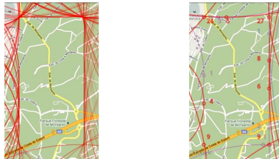
Fig. 3. Halo (left) and HaloDot with aggregation and number clues (right).

In resemblance of what is done with on-screen icons cluttering [7], we propose an aggregation approach to mitigate the clutter problem when arcs density is high (Fig. 3 right). We consider the existence of a hypothetical grid, based on geographic coordinates, overlaying the map, which divides the geographical space into cells. The grid has a default size, though it can be changed by the user. Unlike the previous situation, where a HaloDot would be drawn for each off-screen object, a HaloDot will be drawn for each cell with at least one object. This means that, in the worst case, we will have as many HaloDots as cells. The color and transparency shown by a HaloDot corresponds to the most relevant object it represents.