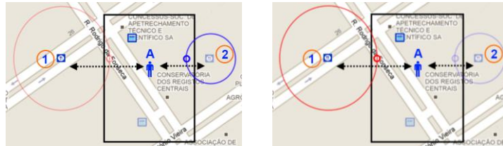
Fig. 2. HaloDot without (left) and with (right) color+transparency to show relevance.

be more visible. This could induce the user to pick the wrong object. To avoid this, the transparency level is also dependent on the object's relevance. An interval of minimum and maximum transparency is set according with the object's relevance. This way, a relevant object will always have a more visible HaloDot than a less relevant one (Fig. 2 right).