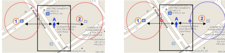
Fig. 1. An example of HaloDot with color. Original Halo (left) and HaloDot (right).

Fig.1 (right) shows the use of this approach applied to the above scenario. The most relevant object is represented with the red HaloDot and the less relevant is represented with a blue and more transparent HaloDot.