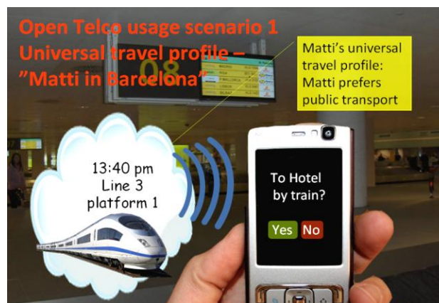
Fig. 1. An excerpt from a scenario illustration (universal travel profile)

We illustrated value proposals 1-5 as PowerPoint clips with a main character named Matti to whom users could relate (Figure 1).