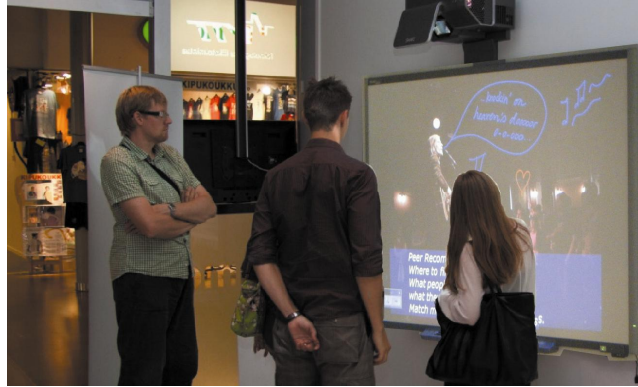
Fig. 4. Ihme innovation showroom

The first period of the studies ran for nine days. The researchers invited ordinary people from the shopping centre to participate in the studies and interviewed a total of 26 people. As the interviews were conducted in an informal way, user demographics were not asked. Compared with the previous two studies, many of the participants in this study were less technology-oriented. The recruitment prioritized English, though Finnish researchers were also available. The participants were first briefed with a set of PowerPoint illustrations of the three first scenarios for a total of two to three minutes. Each participant was then interviewed by a researcher with a list of twelve predefined questions that covered personal preferences and acceptance of each value proposal, as well as ideas for additional services. The interviews were semi-structured and interactive. Many participants therefore used their personal experiences to express their opinions. The interviews lasted ten to twenty minutes.