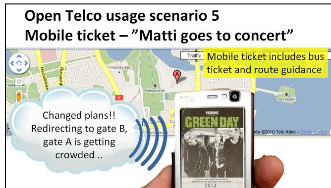
Fig. 2. Illustration of a mobile ticket scenario

Eight in-house scientists (four female and four male) who work in the area of ICT for Health participated in the focus group study. One researcher chaired the focus group and another observed and took notes. The scenario of value proposal 4 was presented to the participants with the PowerPoint illustrations. After the presentation, the following themes were discussed: