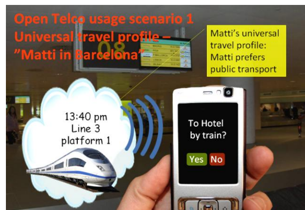
Fig. 1. An excerpt from a scenario illustration (universal travel profile)

We illustrated value proposals 1-5 as PowerPoint clips with a main character named Matti to whom users could relate (Figure 1).