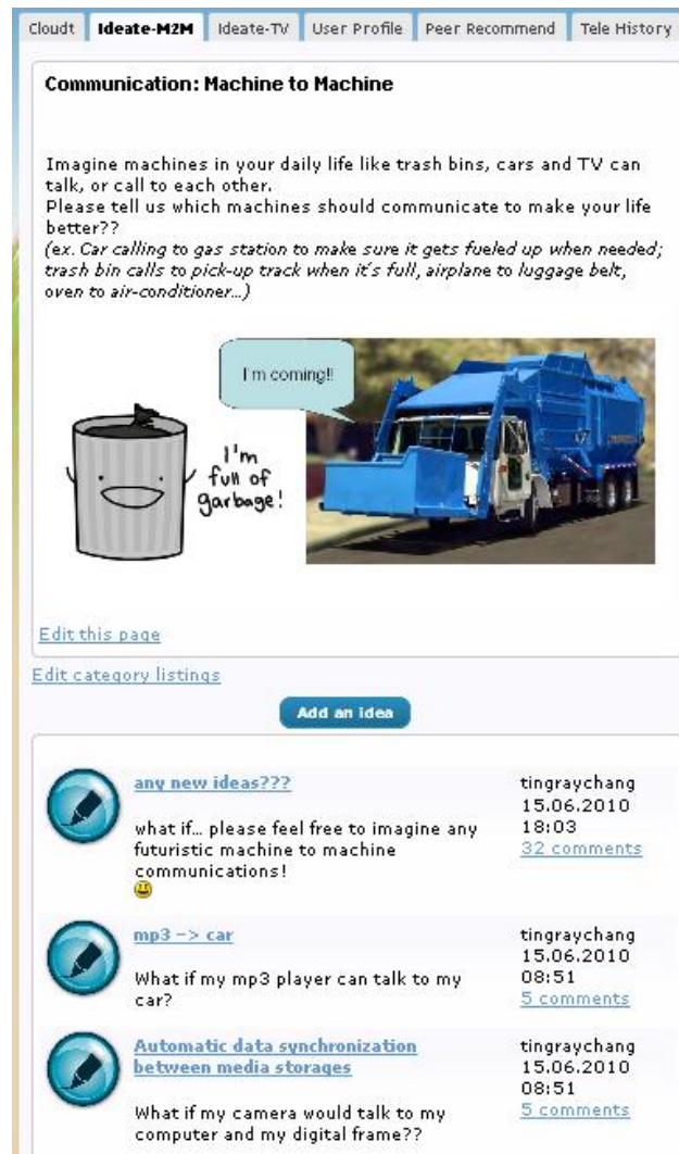
Fig. 3. Screenshot of the Owela online ideation page for machine-to-machine communication

The online studies lasted a month in total. During the first two weeks, new users were invited from university email newsletters, online international student groups and Facebook to discuss the first three value proposals. Forty-six new users joined Owela during the first two weeks to participate in our study. During the following two weeks, existing Owela users were also invited and the two new value proposals were added (Future TV and Machine-to-machine communication). The participants came from 11 countries in Europe, North America and Asia. All the users used English as the communication language. Owela online ideations and evaluations involved a total of 84 users. There were 48 males, 33 females and 3 unknowns. The ages of the participants ranged from 18 to 68. Two researchers participated in moderating the