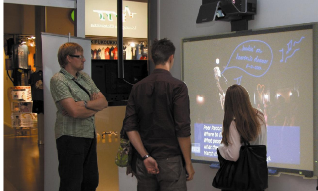
Fig. 4. Ihme innovation showroom

The first period of the studies ran for nine days. The researchers invited ordinary people from the shopping centre to participate in the studies and interviewed a total of 26 people. As the interviews were conducted in an informal way, user demographics were not asked. Compared with the previous two studies, many of the participants in this study were less technology-oriented. The recruitment prioritized English, though Finnish researchers were also available. The participants were first briefed with a set of PowerPoint illustrations of the three first scenarios for a total of two to three minutes. Each participant was then interviewed by a researcher with a list of twelve predefined questions that covered personal preferences and acceptance of each value proposal, as well as ideas for additional services. The interviews were semi-structured and interactive. Many participants therefore used their personal experiences to express their opinions. The interviews lasted ten to twenty minutes.