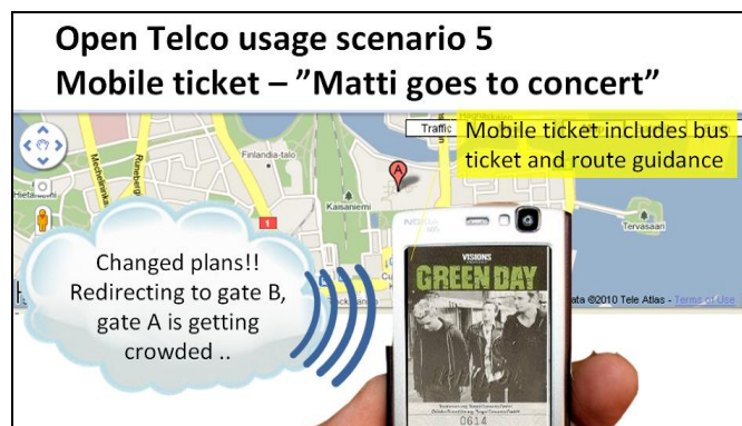
Fig. 2. Illustration of a mobile ticket scenario

Eight in-house scientists (four female and four male) who work in the area of ICT for Health participated in the focus group study. One researcher chaired the focus group and another observed and took notes. The scenario of value proposal 4 was presented to the participants with the PowerPoint illustrations. After the presentation, the following themes were discussed: