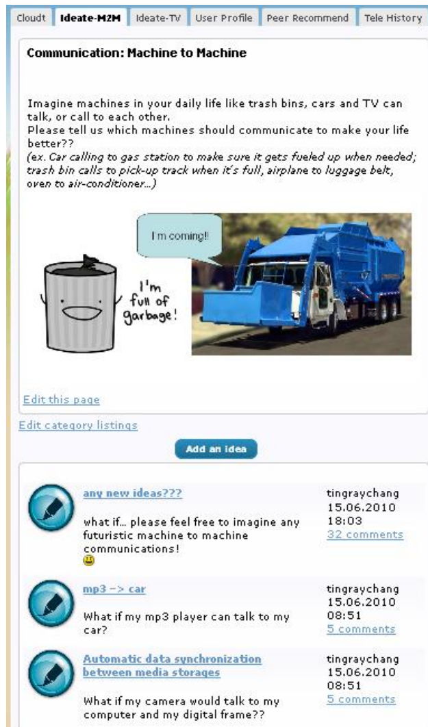
Fig. 3. Screenshot of the Owela online ideation page for machine-to-machine communication

The online studies lasted a month in total. During the first two weeks, new users were invited from university email newsletters, online international student groups and Facebook to discuss the first three value proposals. Forty-six new users joined Owela during the first two weeks to participate in our study. During the following two weeks, existing Owela users were also invited and the two new value proposals were added (Future TV and Machine-to-machine communication). The participants came from 11 countries in Europe, North America and Asia. All the users used English as the communication language. Owela online ideations and evaluations involved a total of 84 users. There were 48 males, 33 females and 3 unknowns. The ages of the participants ranged from 18 to 68. Two researchers participated in moderating the