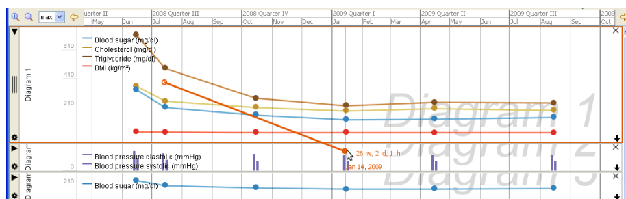
Fig. 2. The first diagram combines several variables. The second and third diagram are resized. The measure tool is shown (slanted orange line) going from the first to the second diagram.

Pan and Zoom : Both were found to be interesting under certain conditions, especially when there were many data items with changing values. However, it must be mentioned that in many cases the line plots in combination with a table showing the concrete values can provide enough information to get a clear overview.