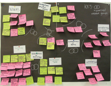
Fig. 2. The Transactions team's board showing their integrated data headings.

The ways in which the groups manipulated the post-it notes in the space available was interesting. One of the groups moved all of their notes onto one side of the black sheets so that they had a clear space to organise them within. They could also be seen placing groups of notes at an angle on the paper as a way to differentiate them from the others. Once each of the teams had finished grouping their boards, they were photographed as a way of saving the layouts so that they could be referred to again later.