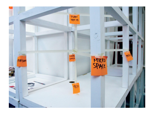
Fig. 4. The axes the workshop participants identified.

4.4.7 Identifying Axis Due to the limitations of the tabletop space, the group quickly started to run out of room. In order to lay the data out more coherently, one of the participants suggested the need to arrange the data along different physical axis. Coincidentally, within the studio space there was a set of wooden exhibition stands. The participants used masking tape attached to them to mark out separate axis. These axes were 'person' to 'people' along the X-axis, 'tech' to 'non-tech' along the Y-axis and 'macro space' to 'micro space' along the Z-axis (Fig. 4).