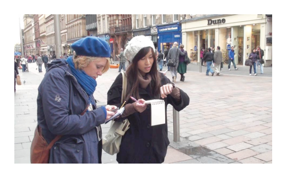
Fig. 1. One of the Interactions teams working out a strategy.

Where there were 2 teams working within the same space, they negotiated amongst themselves to try and eliminate the possibility of a crossover. For example, the 2 teams working on the transactions theme inside the shopping centre deliberately went to the highest and lowest floors so that more ground could be covered in the time available.