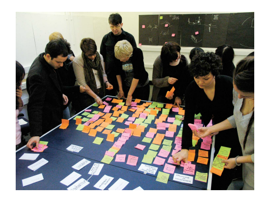
Fig. 3. Arranging the data into the super themes.

This provided the group with another new space to think about all of the gathered data that had emerged from an attempt to organise it under the super headings. The next stage of analysis for the participants would be to try to map all of the post-it notes along each of these newly identified axes. The workshop had already ran an hour over the original scheduled time at this point so was drawn to a close. Photographs of all the post-it layouts at the end of the session were taken to document how far the participants had progressed with analysing the data.