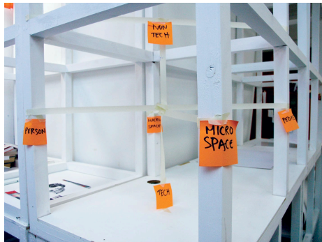
Fig. 4. The axes the workshop participants identified.

4.4.7 Identifying Axis Due to the limitations of the tabletop space, the group quickly started to run out of room. In order to lay the data out more coherently, one of the participants suggested the need to arrange the data along different physical axis. Coincidentally, within the studio space there was a set of wooden exhibition stands. The participants used masking tape attached to them to mark out separate axis. These axes were ‘person’ to ‘people’ along the X-axis, ‘tech’ to ‘non-tech’ along the Y-axis and ‘macro space’ to ‘micro space’ along the Z-axis (Fig. 4).