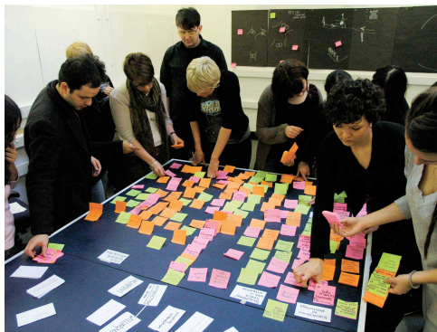
Fig. 3. Arranging the data into the super themes.

This provided the group with another new space to think about all of the gathered data that had emerged from an attempt to organise it under the super headings. The next stage of analysis for the participants would be to try to map all of the post-it notes along each of these newly identified axes. The workshop had already run an hour over the original scheduled time at this point so was drawn to a close. Photographs of all the post-it layouts at the end of the session were taken to document how far the participants had progressed with analysing the data.