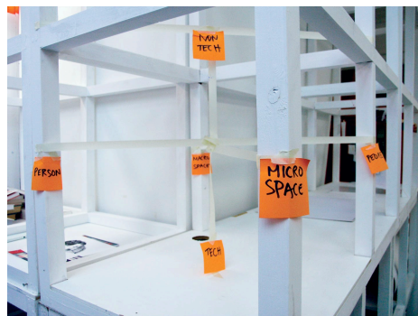
Fig. 4. The axes the workshop participants identified.

4.4.7 Identifying Axis Due to the limitations of the tabletop space, the group quickly started to run out of room. In order to lay the data out more coherently, one of the participants suggested the need to arrange the data along different physical axis. Coincidentally, within the studio space there was a set of wooden exhibition stands. The participants used masking tape attached to them to mark out separate axis. These axes were ‘person’ to ‘people’ along the X-axis, ‘tech’ to ‘non-tech’ along the Y-axis and ‘macro space’ to ‘micro space’ along the Z-axis (Fig. 4).