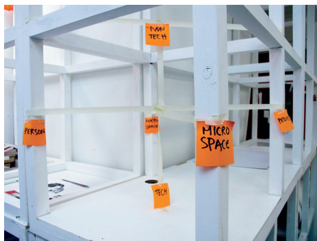
Fig. 4. The axes the workshop participants identified.

4.4.7 Identifying Axis Due to the limitations of the tabletop space, the group quickly started to run out of room. In order to lay the data out more coherently, one of the participants suggested the need to arrange the data along different physical axis. Coincidentally, within the studio space there was a set of wooden exhibition stands. The participants used masking tape attached to them to mark out separate axis. These axes were ‘person’ to ‘people’ along the X-axis, ‘tech’ to ‘non-tech’ along the Y-axis and ‘macro space’ to ‘micro space’ along the Z-axis (Fig. 4).