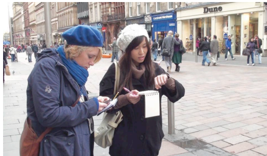
Fig. 1. One of the Interactions teams working out a strategy.

Where there were 2 teams working within the same space, they negotiated amongst themselves to try and eliminate the possibility of a crossover. For example, the 2 teams working on the transactions theme inside the shopping centre deliberately went to the highest and lowest floors so that more ground could be covered in the time available.