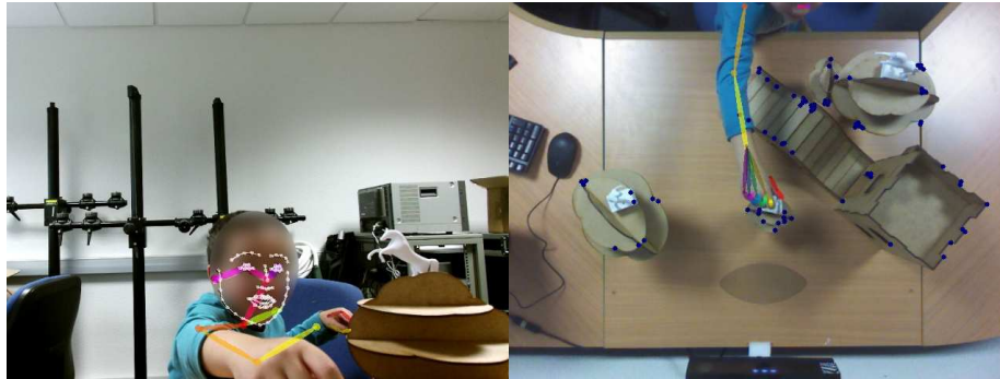
Figure 1: View from a storytelling session with a 6-year old child using the Figurines framework. At left, the frontal view with body and face detections (eyes, ears, nose, neck, shoulders, arms, hands) and facial landmarks of the storyteller using OpenPose [1]. At right, top view with body and hand detection, and decor tracking (blue points). Tracking of figurines is done using a hybrid IMU/RGB-D approach.

Narrative is widely considered to be a fundamental part of human cognition and understanding [3]. Today, storytelling is increasingly performed digitally and it is becoming easier to create stories using available digital technologies [4]. Storytelling is especially important for children education by supporting and enhancing creative expression and learning, as well as encouraging team work and sharing of personal experience [5, 6, 7].