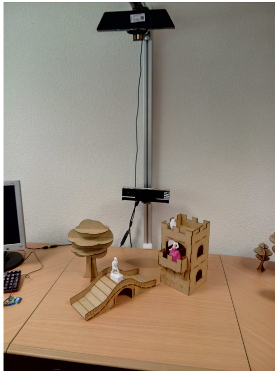
Figure 2: Acquisition setup. There are two Kinect devices: one looking down to follow figurines, one following narrators. The playground area is the table in the middle. Its size in our experiment is 70cm x 70cm.

frame rate is 200Hz. Moreover, real time processing would cause a limited choice for computer vision algorithms used in the framework. As on-line processing is not mandatory for the storyteller, and would not improve the session, it is not a constraint in the framework.