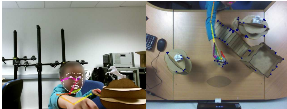
Figure 1: View from a storytelling session with a 6-year old child using the Figurines framework. At left, the frontal view with body and face detections (eyes, ears, nose, neck, shoulders, arms, hands) and facial landmarks of the storyteller using OpenPose [1]. At right, top view with body and hand detection, and decor tracking (blue points). Tracking of figurines is done using a hybrid IMU/RGB-D approach.

around the world, and they always played an important role in human society [2]. Narrative is widely considered to be a fundamental part of human cognition and understanding [3]. Today, storytelling is increasingly performed digitally and it is becoming easier to create stories using available digital technologies [4]. Storytelling is especially important for children education by supporting and enhancing creative expression and learning, as well as encouraging team work and sharing of personal experience [5, 6, 7].