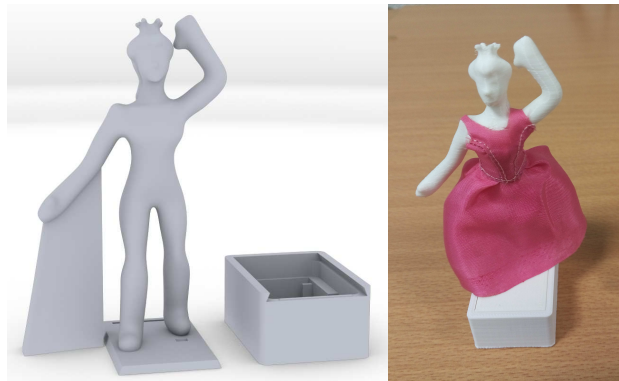
Figure 3: At left, 3D models used to print an enhanced princess figurine. At right, the result dressed figurine.