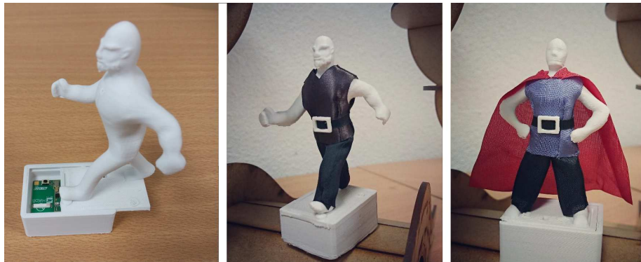
Figure 4: Figurine examples. Left, the IMU in the basement of the soldier figurine. Center and right, the soldier and prince dressed figurines respectively.

IMUs demonstrated that even a 50Hz frame rate is not reliable enough to reconstruct 3D path because of acceleration information sparsity and drift. Among professional available IMUs, we selected the 10-degrees-of-freedom Hikob Fox IMU 1 . This choice was driven by several technical aspects. These sensors are very light (~20 gr with their embedded battery, memory card and printed basement). They are able to record gyroscope, accelerometer and magnetometer data at high frame rate (up to 200Hz) on their memory card. Their storage and their rechargeable battery allow an autonomy of several hours. Last crucial point, using wireless synchronization, all IMUs share a common time reference. For decor elements, everything that fit the playing area can be used and tracked by the framework. In our prototype, we designed decor objects with a laser cutter (see figure 2). These decor elements fit perfectly with the figurines, as their scale has been chosen accordingly.