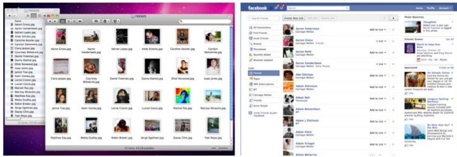
Fig. 2. Left: Screen capture of possible view options and friend photos in the file hierarchy mechanism. Right: Screen capture of Facebook's edit friends page, with the friends tab selected.

Figure 2, right) that, while unfamiliar to most users, allows users to see if each of their friends had been placed into a friend list. (By default the edit friends view also includes Facebook “Pages” that a user might also have “liked” and can also be placed into friend lists, which is why we directed users to click the Friends tab on the left).