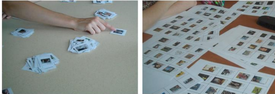
Fig. 1. Left: A participant using the card sorting mechanism points to a group of one friend during the privacy scenarios section of the interview. Right: A participant using the grid tagging mechanism reviews her friends, after having tagged them with colored markers during the privacy scenarios section of the interview.