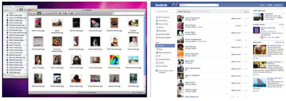
Fig. 2. Left: Screen capture of possible view options and friend photos in the file hierarchy mechanism. Right: Screen capture of Facebook's edit friends page, with the friends tab selected.

Figure 2, right) that, while unfamiliar to most users, allows users to see if each of their friends had been placed into a friend list. (By default the edit friends view also includes Facebook “Pages” that a user might also have “liked” and can also be placed into friend lists, which is why we directed users to click the Friends tab on the left).