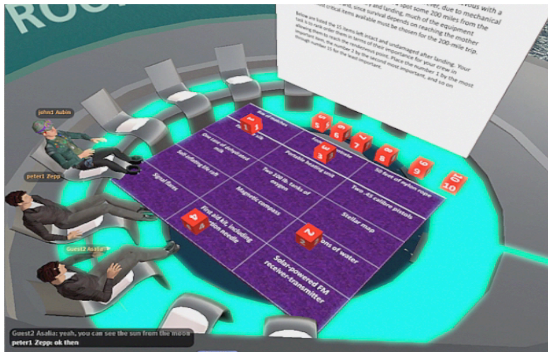
Figure 1b. Screen dump showing SecondLife with group discussion

Voice communication was not used, since we wished to focus on the avatar versus conventional UI interaction, rather than compare communication modalities. Furthermore text chat is commonly used in SL when audio output can be annoying in public contexts such as co located class with several groups. Text communication had the added advantage of recorded transcripts of conversations for qualitative analysis. No verbal or FTF visual contact was allowed in either the BB or SL conditions.