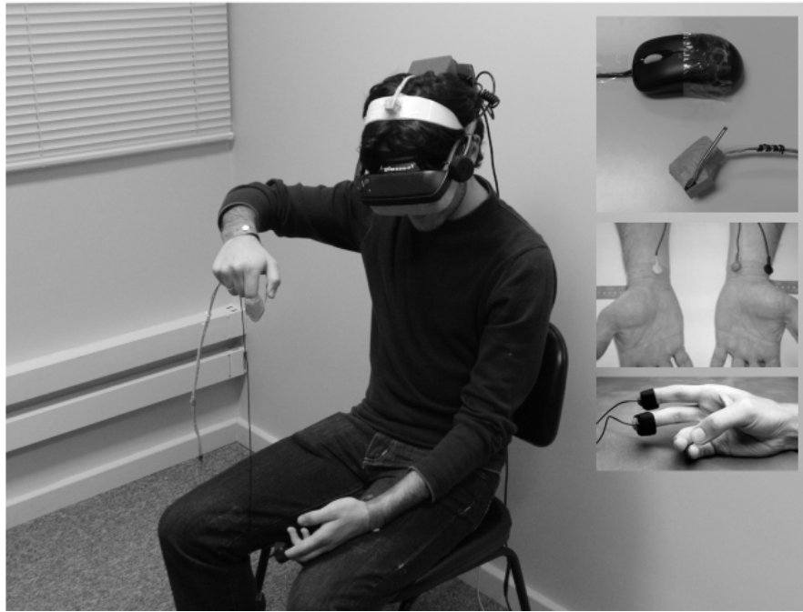
Fig. 2. Subject wearing physiological and VR devices during the experiment.

Figure 2 presents the device's default configuration, highlighting the push-button attached to one of the tracking-points, and positions of the ECG and SC sensors.