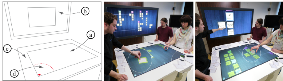
Fig. 2. AffinityTable combines different workspaces by using digital pen & paper, an interactive table with tangible tools and a coupled, high-resolution vertical display.

AffinityTable was designed in an iterative design process. In a first step, a workspace was developed to address the findings from our study. In a second step, specific hybrid interaction techniques were designed to support and augment the workflow and tasks within affinity diagramming.