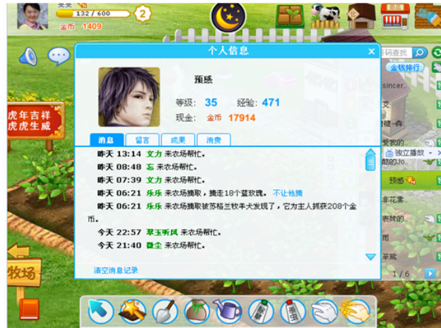
Fig.2. Screenshot of a personal message board in QQ Farm