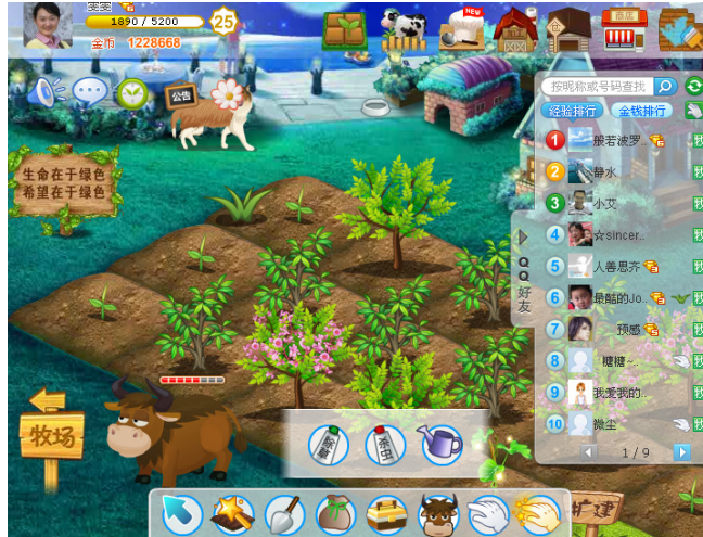
Fig.1. Screenshot of the first author's QQ Farm

Each activity a player performs on her own farm is rewarded by experience points or, with virtual gold coins through the selling of mature crops. Accumulated experience points can raise the player's level in the game. The higher the player's game level is, the more privileges she has to expand her farming field. Similarly, the more coins the player has, the more "money" she has to purchase expensive crops and fields. Weeding and irrigating for other players are considered helpful in the gaming environment since it helps the other farm owners obtain additional experience points or coins. On the contrary, stealing other players' mature crops is considered a mischievous action since the owner is no longer able to gain virtual gold coins by selling her stolen crops.